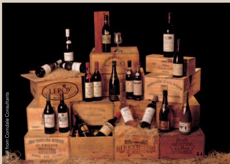
Visual from Comdale Consultants